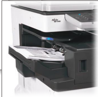
500-Sheet Internal Finisher