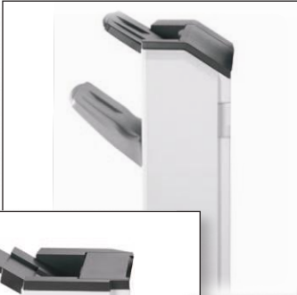
1,000-Sheet Booklet Finisher

500-Sheet External Finisher (optional) Realize greater cost savings and productivity by printing reports and presentations in-house.